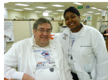
Help keep the dental students focused on the road ahead.

are welcomed into the program by existing participants. From there, the mentors and protégés define where they want the relationship to go.